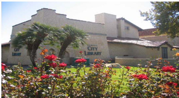
Above: The Palmdale City Library located at 700 East Palmdale Boulevard