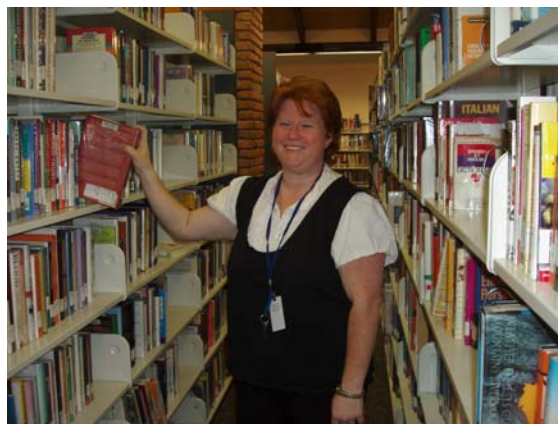
Above: A City of Palmdale Volunteer puts a library book back into circulation